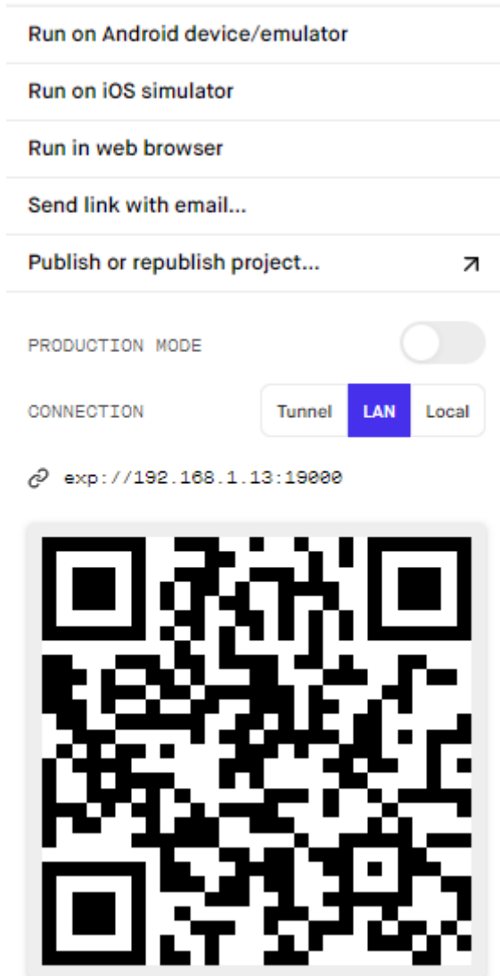
Figure 7. QR code.