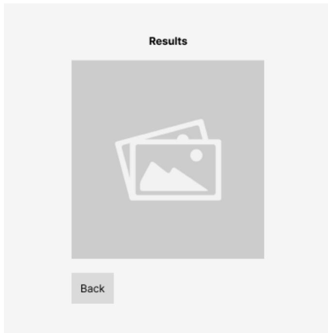
Figure 2 (Tremblay, 2021)

Once the object detection models have finished calculating the outputs for the given image, the user will be redirected to a results page (Figure 2) where the results from the detection models will be displayed over the original uploaded image. The user then has the option of returning to the home page by clicking a ‘back’ button.